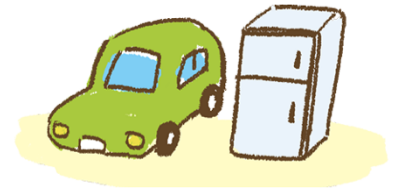
cars, home appliances and etc.

Please contact your embassy or immigration Office